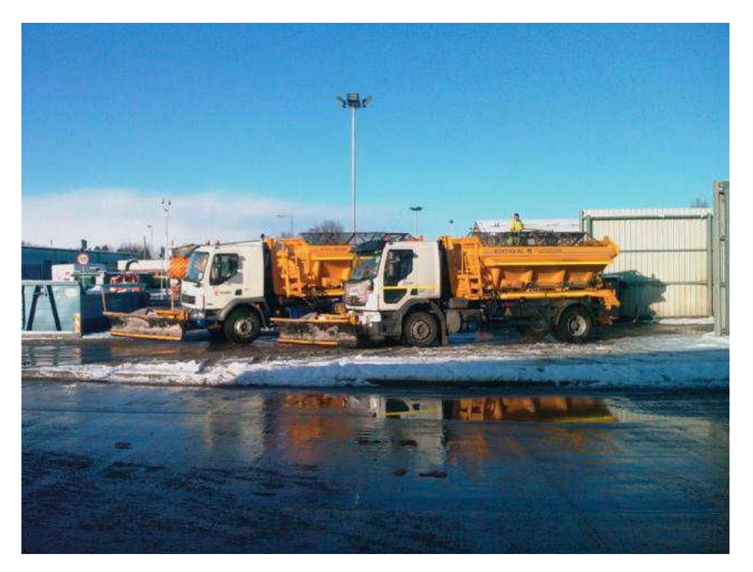
Gritters in between runs being washed down at the eco Depot

I am grateful to partners who helped out during the situation, in particular Age Concern who were able to ensure that there was additional capacity to the social care teams to respond to calls for assistance. Support for a 'Good Neighbour' campaign to encourage the neighbourliness that already operates in the city, was given by the Press, church organisations and the Neighbourhood Watch system.